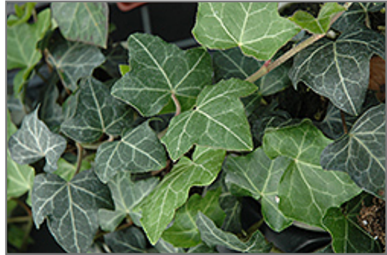
Baltic Ivy foliage