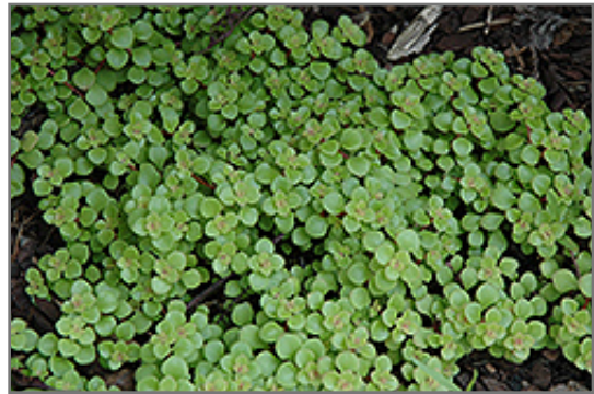
Golden Stonecrop