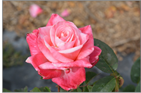
First Prize Rose flowers