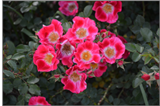
Carefree Spirit Rose flowers

Carefree Spirit Rose is recommended for the following landscape applications;