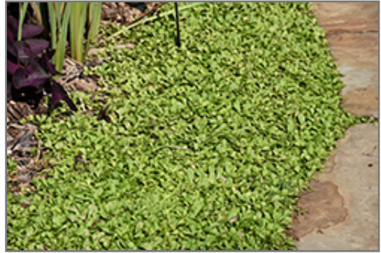
Creeping Mazus

Creeping Mazus will grow to be only 2 inches tall at maturity extending to 3 inches tall with the flowers, with a spread of 12 inches. Its foliage tends to remain low and dense right to the ground. It grows at a fast rate, and under ideal conditions can be expected to live for approximately 10 years. As an evergreen perennial, this plant will typically keep its form and foliage year-round.