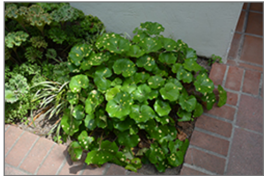
Variegated Leopard Plant