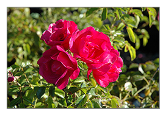
Flower Carpet Pink Rose flowers

2301 San Joaquin Hills Rd. Corona del Mar, CA 92625 phone: 949.640.5800 www.rogersgardens.com