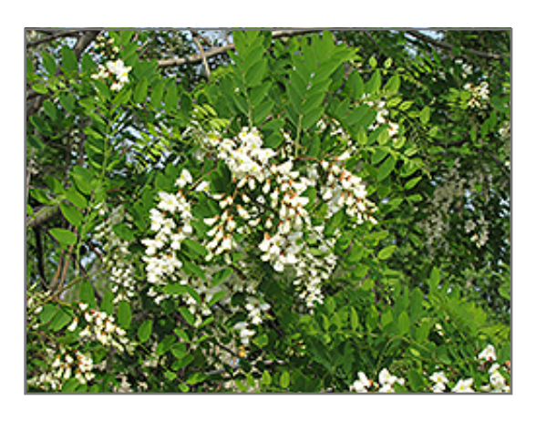
Black Locust flowers