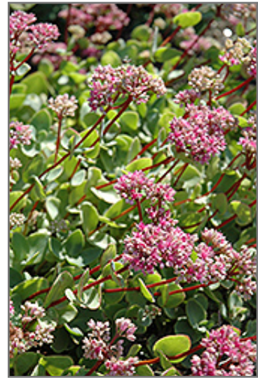
October Daphne flowers