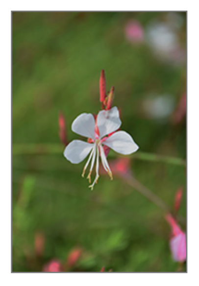
Butterfly Gaura flowers

2301 San Joaquin Hills Rd. Corona del Mar, CA 92625 phone: 949.640.5800 www.rogersgardens.com