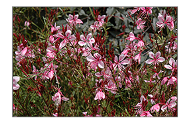
Butterfly Gaura flowers