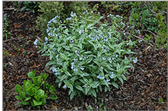
Roy Davidson Lungwort in bloom