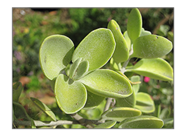
Silver Teaspoons foliage

This is a relatively low maintenance plant, and should not require much pruning, except when necessary, such as to remove dieback. It has no significant negative characteristics.