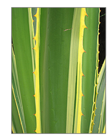
Variegated Sword Lily foliage

This shrub will require occasional maintenance and upkeep, and usually looks its best without pruning, although it will tolerate pruning. Gardeners should be aware of the following characteristic(s) that may warrant special consideration;