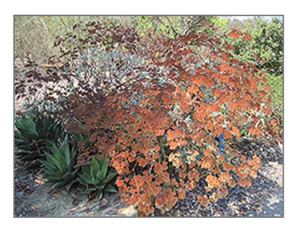
St. Catherine's Lace in bloom