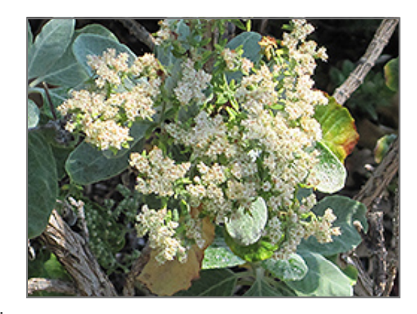
St. Catherine's Lace flowers

St. Catherine's Lace is recommended for the following landscape applications;