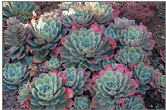
Blue Mist Echeveria