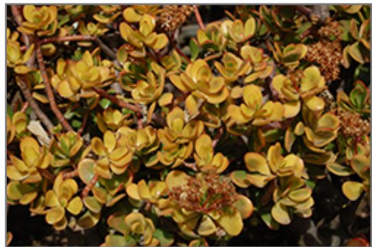
Hummel's Sunset Golden Jade Plant foliage