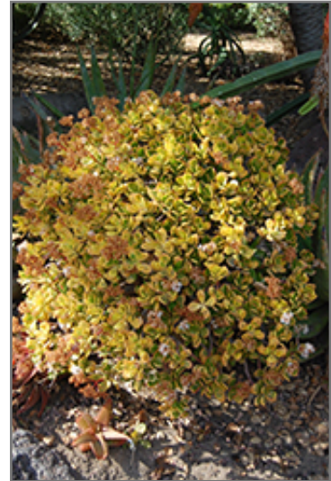
Hummel's Sunset Golden Jade Plant in bloom

Hummel's Sunset Golden Jade Plant is a multi-stemmed evergreen shrub with an upright spreading habit of growth. Its average texture blends into the landscape, but can be balanced by one or two finer or coarser trees or shrubs for an effective composition.