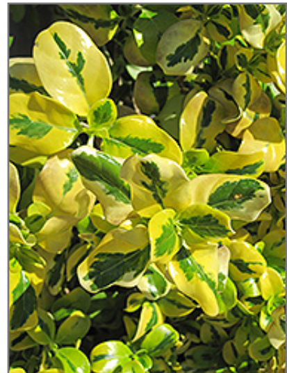
Taupata Gold Mirror Bush foliage