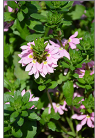
Scampi Pink Fan Flower flowers