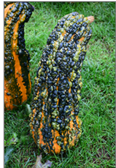
Lunch Lady Gourd fruit