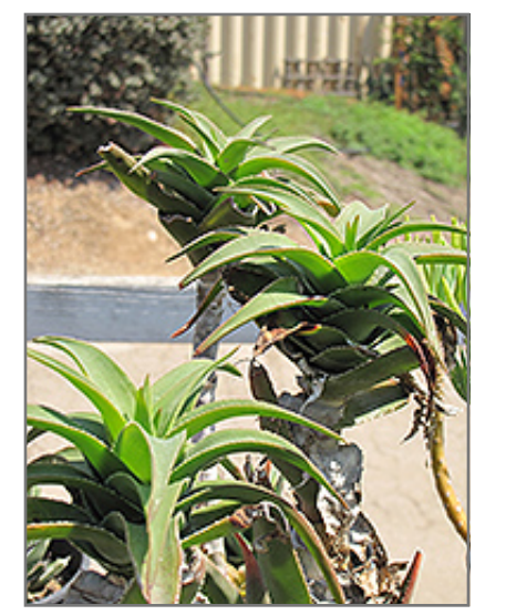
Firewall Groundcover Aloe

2301 San Joaquin Hills Rd. Corona del Mar, CA 92625 phone: 949.640.5800 www.rogersgardens.com