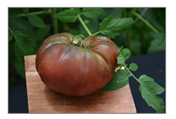
Black Pineapple Tomato fruit

2301 San Joaquin Hills Rd. Corona del Mar, CA 92625 phone: 949.640.5800 www.rogersgardens.com