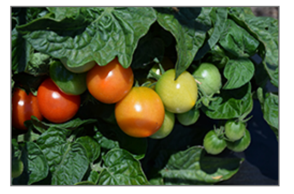
Ponchi-Re Tomato fruit

Ponchi-Re Tomato is an annual vegetable plant that is typically grown for its edible qualities. It produces small clusters of red round tomatoes (which are technically 'berries') with red flesh which are usually ready for picking from mid to late summer. This is a determinate variety, which means it bears a full crop all at once. The tomatoes have a pleasant taste and a firm texture.