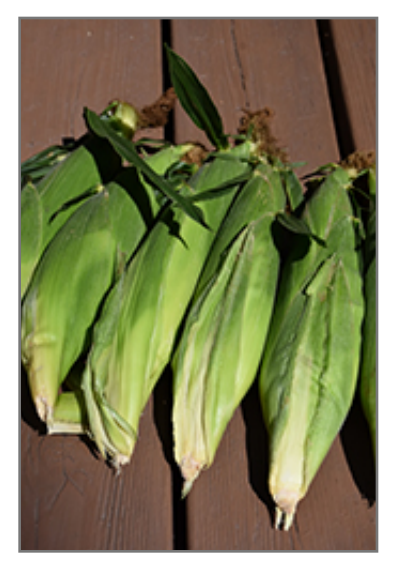
Anthem Sweet Corn fruit