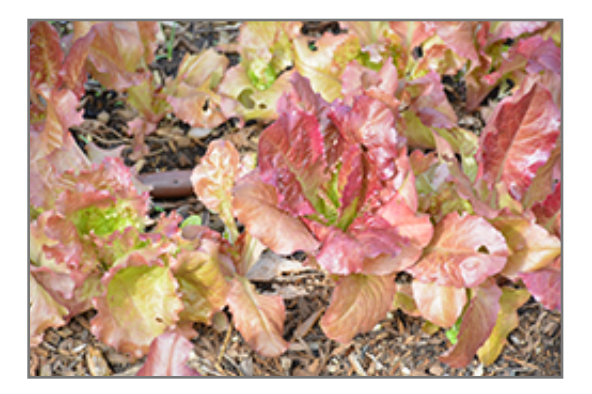
Flame Lettuce

2301 San Joaquin Hills Rd. Corona del Mar, CA 92625 phone: 949.640.5800 www.rogersgardens.com