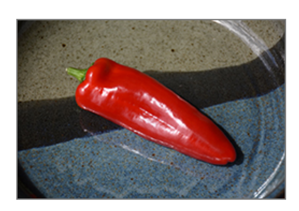
Sweet Sunset Pepper fruit

Sweet Sunset Pepper will grow to be about 28 inches tall at maturity, with a spread of 24 inches. When planted in rows, individual plants should be spaced approximately 24 inches apart. This vegetable plant is an annual, which means that it will grow for one season in your garden and then die after producing a crop.