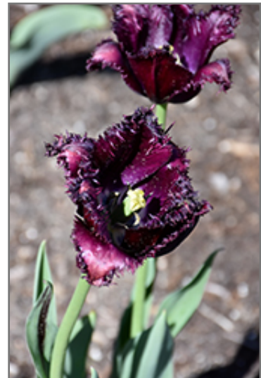
Black Parrot Tulip flowers