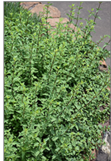
Hopley's Oregano