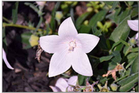
Pop Star Pink Balloon Flower flowers

Pop Star Pink Balloon Flower is recommended for the following landscape applications;