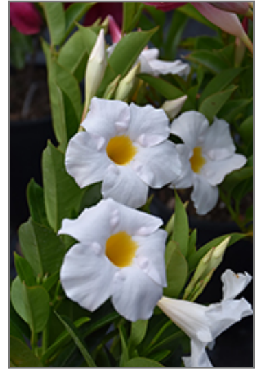
Sundenia White Mandevilla flowers

This is a multi-stemmed evergreen houseplant with a spreading, ground-hugging habit of growth. This plant can be pruned at any time to keep it looking its best.