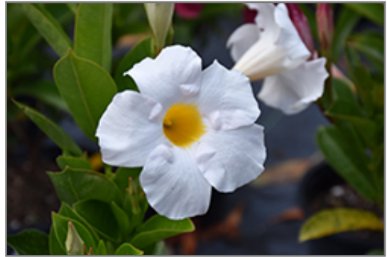
Sundenia White Mandevilla flowers