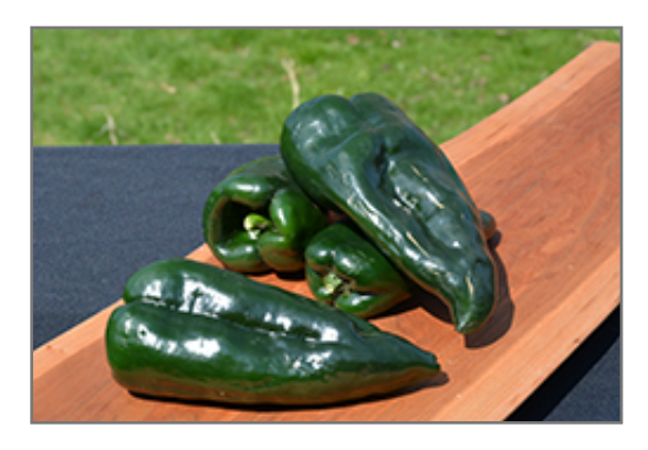
Capulin Pepper fruit

Capulin Pepper will grow to be about 24 inches tall at maturity, with a spread of 18 inches. When planted in rows, individual plants should be spaced approximately 24 inches apart. This vegetable plant is an annual, which means that it will grow for one season in your garden and then die after producing a crop.