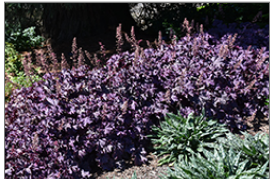
Grande Amethyst Coral Bells in bloom