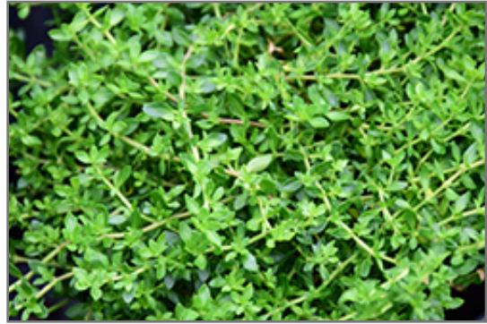
Rupturewort foliage

Rupturewort is recommended for the following landscape applications;