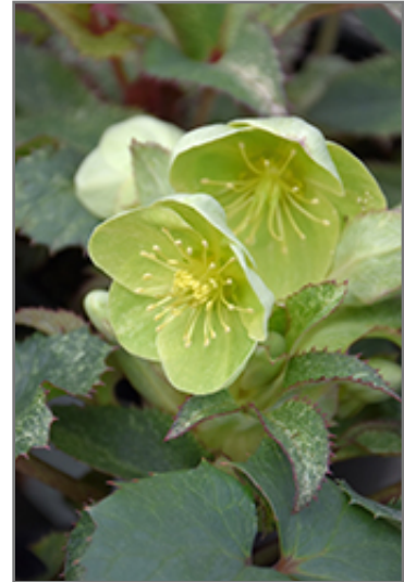
Pacific Frost Corsican Hellebore flowers

Pacific Frost Corsican Hellebore is recommended for the following landscape applications;