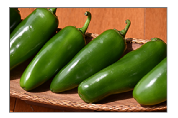
Jalafuego Hot Pepper fruit