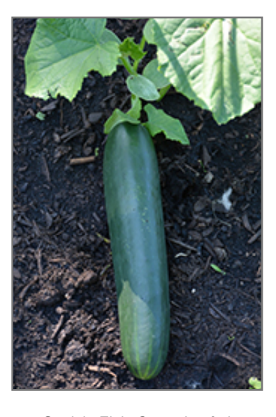
Straight Eight Cucumber fruit

Straight Eight Cucumber will grow to be about 8 inches tall at maturity, with a spread of 5 feet. When planted in rows, individual plants should be spaced approximately 24 inches apart. This vegetable plant is an annual, which means that it will grow for one season in your garden and then die after producing a crop.