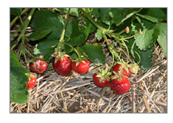
Wendy Strawberry fruit

Wendy Strawberry features dainty white cup-shaped flowers with yellow eyes at the ends of the stems in mid spring. Its serrated round compound leaves remain dark green in color throughout the season. It features an abundance of magnificent red berries in late spring.