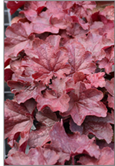
Northern Exposure Red Coral Bells foliage

Northern Exposure Red Coral Bells is recommended for the following landscape applications;