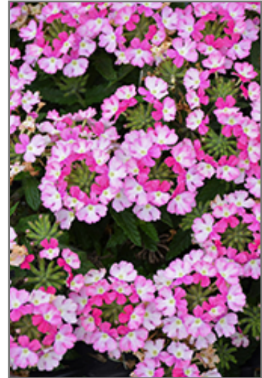
Vanessa Bicolor Pink Verbena flowers

This plant will require occasional maintenance and upkeep. Trim off the flower heads after they fade and die to encourage more blooms late into the season. Deer don't particularly care for this plant and will usually leave it alone in favor of tastier treats. It has no significant negative characteristics.