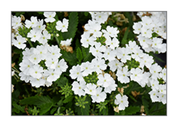
Lanai Upright White Verbena flowers