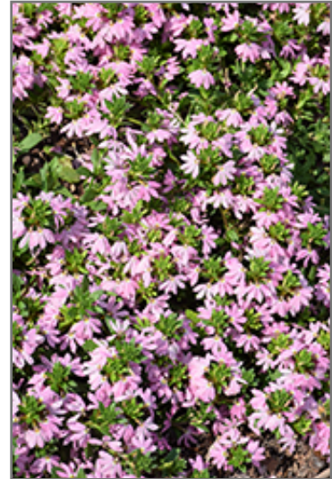
Surdiva Classic Pink Fan Flower flowers

Surdiva Classic Pink Fan Flower is recommended for the following landscape applications;