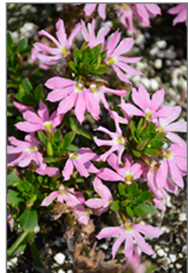
Surdiva Classic Pink Fan Flower flowers