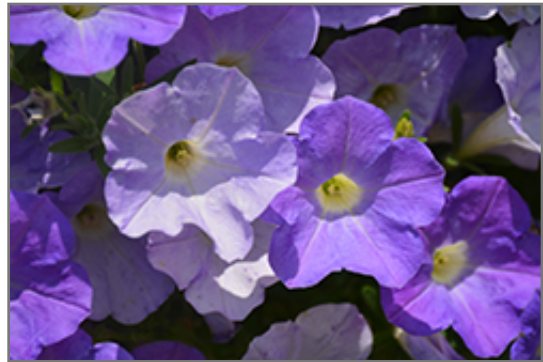
Dekko Sky Blue Petunia flowers

This plant will require occasional maintenance and upkeep. Trim off the flower heads after they fade and die to encourage more blooms late into the season. It is a good choice for attracting butterflies and hummingbirds to your yard, but is not particularly attractive to deer who tend to leave it alone in favor of tastier treats. It has no significant negative characteristics.