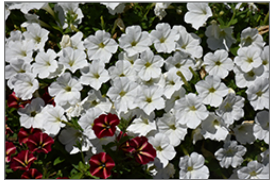
ColorRush White Petunia flowers

ColorRush White Petunia is recommended for the following landscape applications;