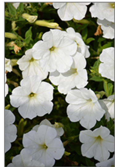
ColorRush White Petunia flowers