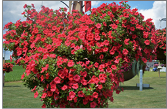
ColorRush Watermelon Red Petunia in bloom

ColorRush Watermelon Red Petunia will grow to be about 12 inches tall at maturity, with a spread of 30 inches. When grown in masses or used as a bedding plant, individual plants should be spaced approximately 24 inches apart. Its foliage tends to remain dense right to the ground, not requiring facer plants in front. This fast-growing annual will normally live for one full growing season, needing replacement the following year.