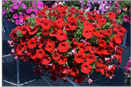
Capella Ruby Red Petunia in bloom

Capella Ruby Red Petunia will grow to be about 12 inches tall at maturity, with a spread of 16 inches. When grown in masses or used as a bedding plant, individual plants should be spaced approximately 12 inches apart. Its foliage tends to remain dense right to the ground, not requiring facer plants in front. This fast-growing annual will normally live for one full growing season, needing replacement the following year.