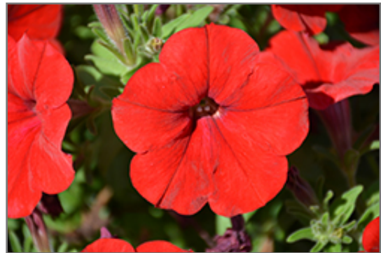
Capella Ruby Red Petunia flowers