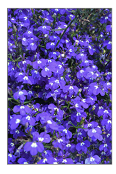
Techno Upright Cobalt Blue Lobelia flowers

This plant will require occasional maintenance and upkeep, and should not require much pruning, except when necessary, such as to remove dieback. It is a good choice for attracting butterflies to your yard. It has no significant negative characteristics.