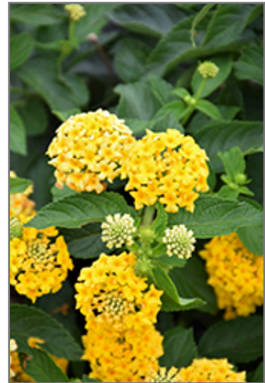
Landscape Bandana Yellow Lantana flowers

Landscape Bandana Yellow Lantana is recommended for the following landscape applications;