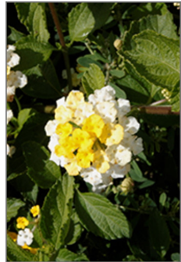
Landscape Bandana Lemon Zest Lantana flowers

Landscape Bandana Lemon Zest Lantana is recommended for the following landscape applications;