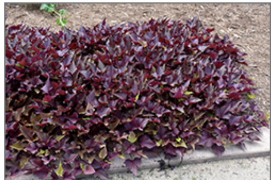
SolarPower Red Heart Sweet Potato Vine