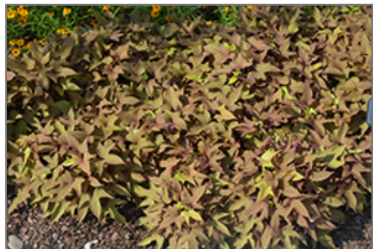
Sidekick Heart Bronze Sweet Potato Vine