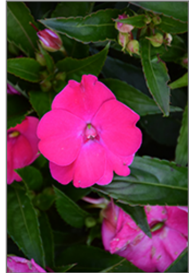
SunPatiens Vigorous Rose Pink New Guinea Impatiens flowers

This plant will require occasional maintenance and upkeep, and should not require much pruning, except when necessary, such as to remove dieback. It has no significant negative characteristics.